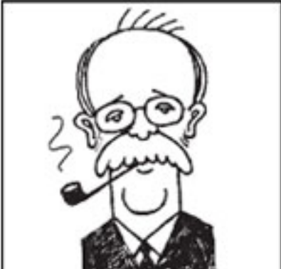
BRUNNEN's work was highly influential in the German satirical art scene, particularly in the early 20th century. His caricatures were often used to critique political figures and social norms.