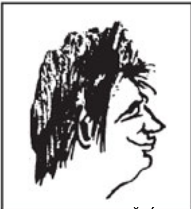
BRUNNEN's work was highly influential in the German satirical art scene, particularly in the early 20th century. His caricatures were often used to critique political figures and social norms.