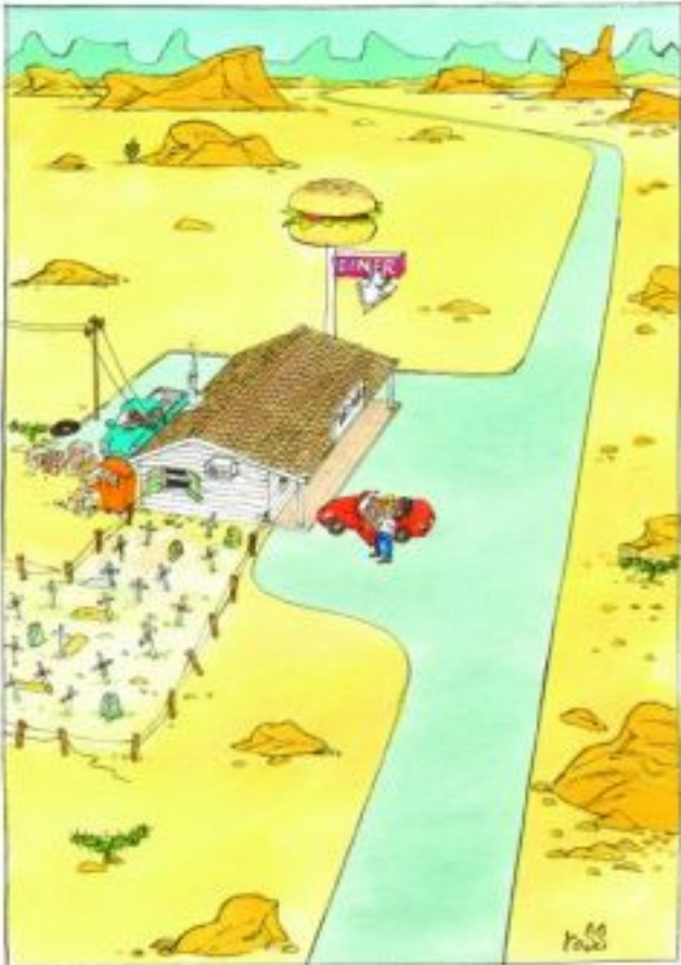
SRPŠKINJE I SALON 2012.