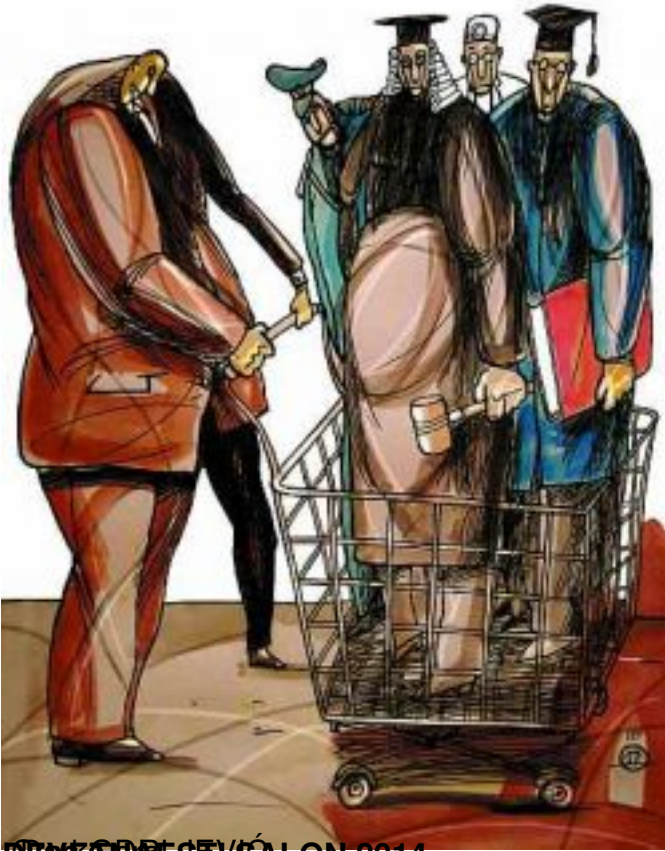
DEMO KRISTIVŠIĆ DEMO KRISTIVŠIĆ SALON 2014.