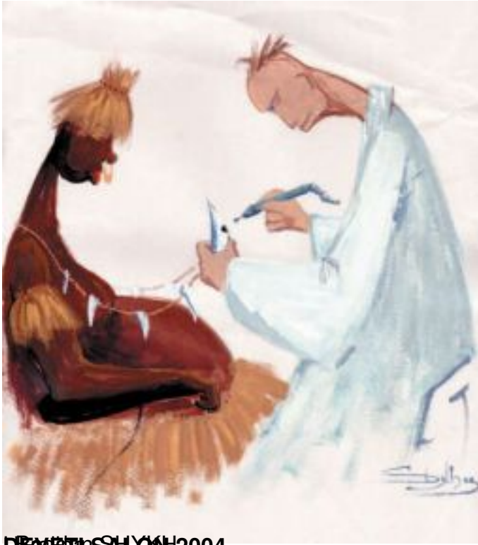
DESETI SALON 2004