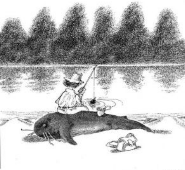
FISH SALON 1998.