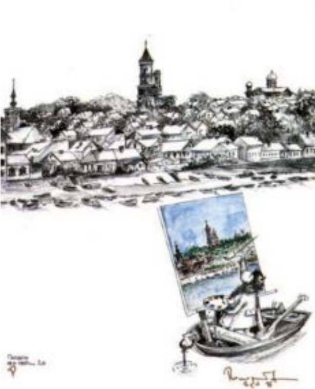
TRAVEL WITH MONIĆ