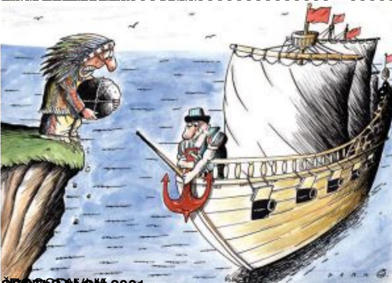
ŠTORMIČ / Šturmik - 2001.