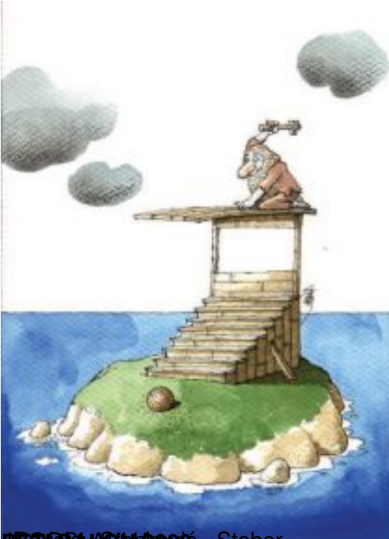
BRNČA / Šturmik - Staber